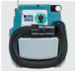
Hose can be stored